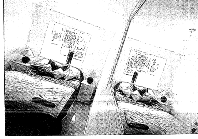
Inside the Jefferson Place show apartment. Prices for smaller studios started from £75,000