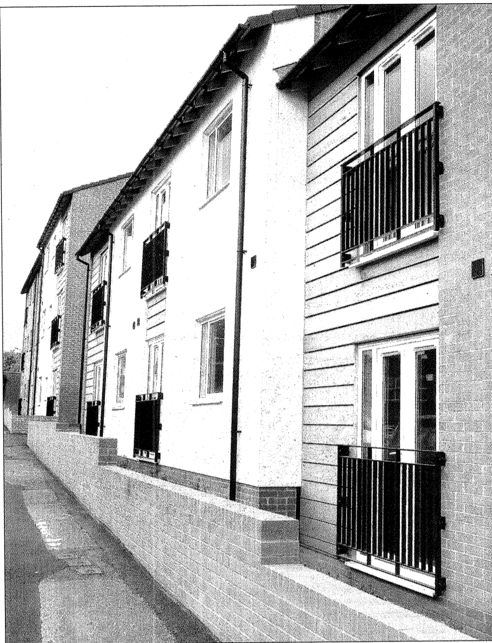
A view of the Jefferson Place apartments at Grafton Road, West Bromwich, one and two bedroom homes by Oakfield Developments, winners in the Starter Homes category of the 2006 Birmingham Post & Mail House Design Awards

"Much of the cost of a building is in the external skin and in this strikingly simple layout, less is more, in